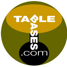
Table Base Assembly Instructions Disc Base Threaded Rod Method